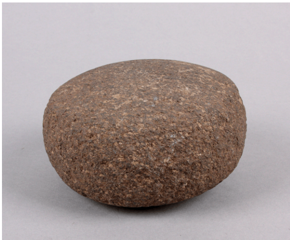
84.1.4, mano, stone

The earliest tools in the archaeological record are hammer stones and choppers, possibly about 3.3 million years old. There may have been other even older tools made of wood or bone, but those materials decay quite easily. Stone tools can last millions of years!