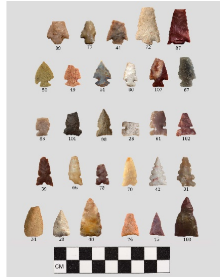
Late prehistoric points

Stone tools are a very important part of the archaeological record and should never be collected without proper permits. If you find one, observe it with your eyes only (or take a picture!) and contact the State Archaeologist to report anything special.