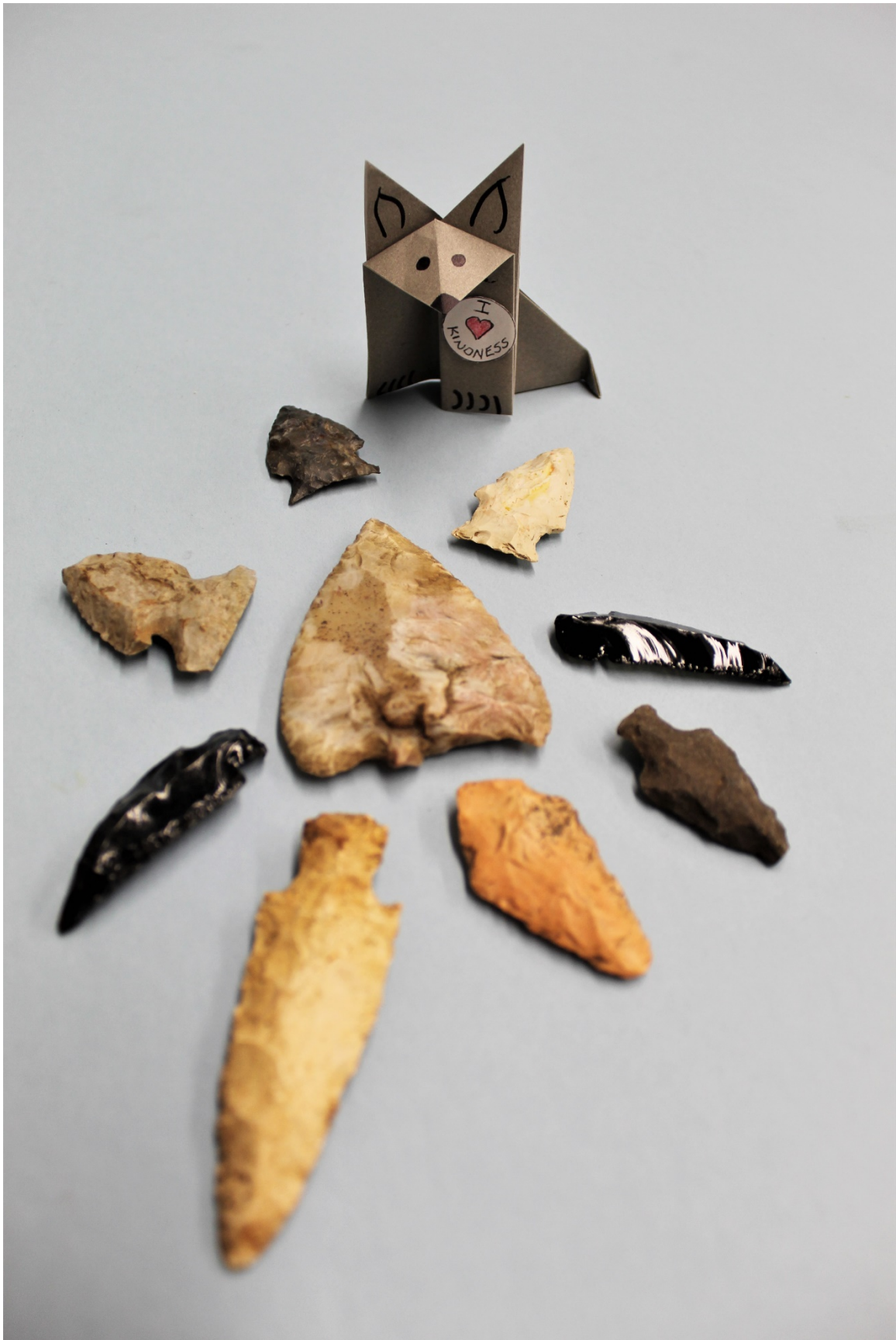
Lulu with a collection of projectile points from the education collection