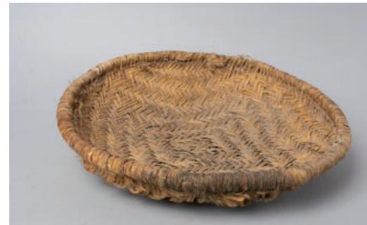
Twilled yucca basket made by Alfonso Ortiz (Ohkay Owingeh), 1959. 69.59.4