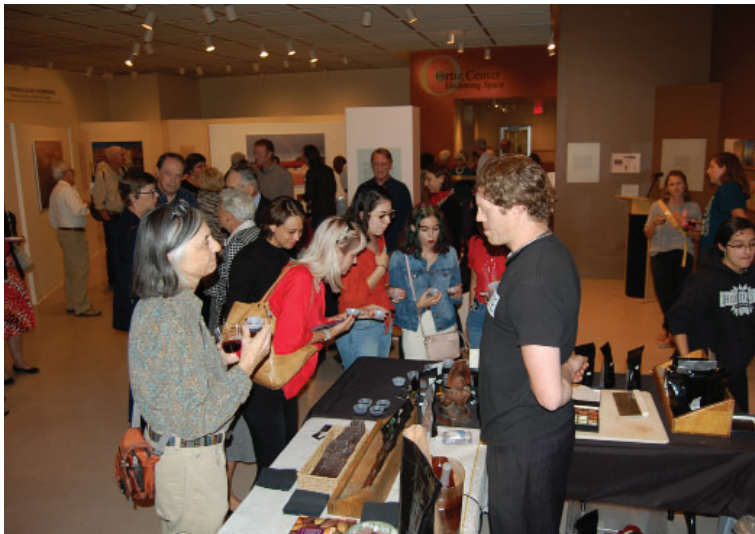
Albuquerque's Chocolate Cartel generously provided refreshments for the Chocolate at Chaco reception