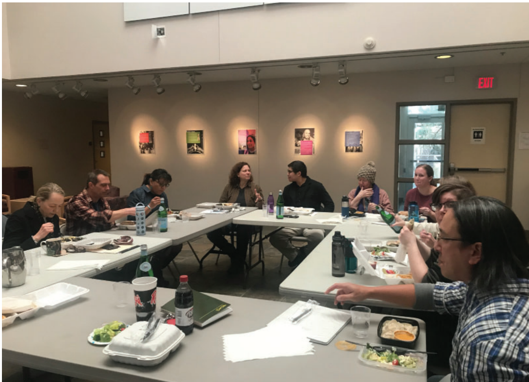
Staff lunch break during strategic planning, December 2019