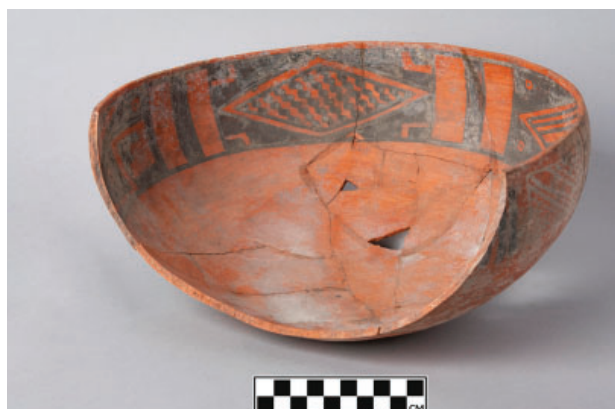
Bowl, Tijeras Pueblo MMA 78.67.47

1717 Lomas Blvd, NE Albuquerque, NM 87131 (505) 277-5853 https://oca.unm.edu/