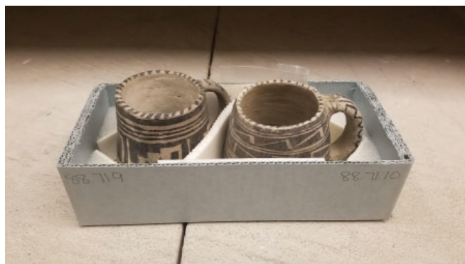
Ceramic mugs 88.71.9 and 88.71.10 in an archival blueboard and Ethafoam mount made by a student employee