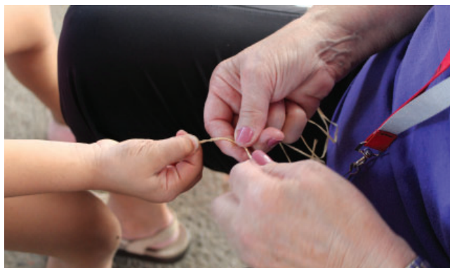
Twining cordage at the Rail Yards Mart Old School Days