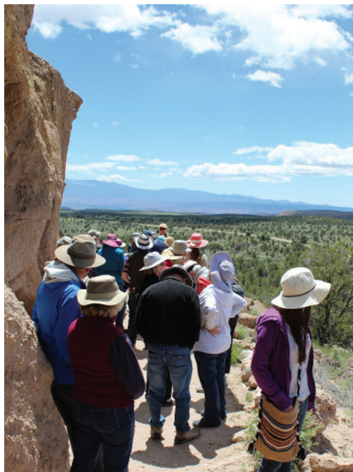
Maxwell docents tour Puye Cliff Dwellings ancestral homeland of Santa Clara Pueblo