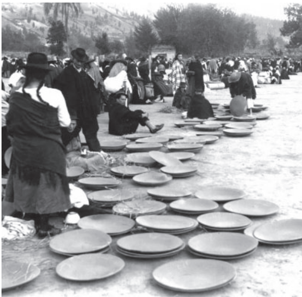
Indigenous potters from Paguche selling pots in the Otavaio Market Ecuador, 1945