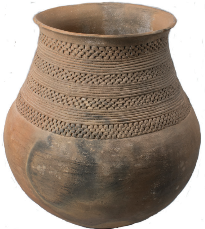
2017.14.1 Ancestral Pueblo corrugated vessel

1717 Lomas Blvd, NE Albuquerque, NM 87131 (505) 277-5853 www.oca.unm.edu