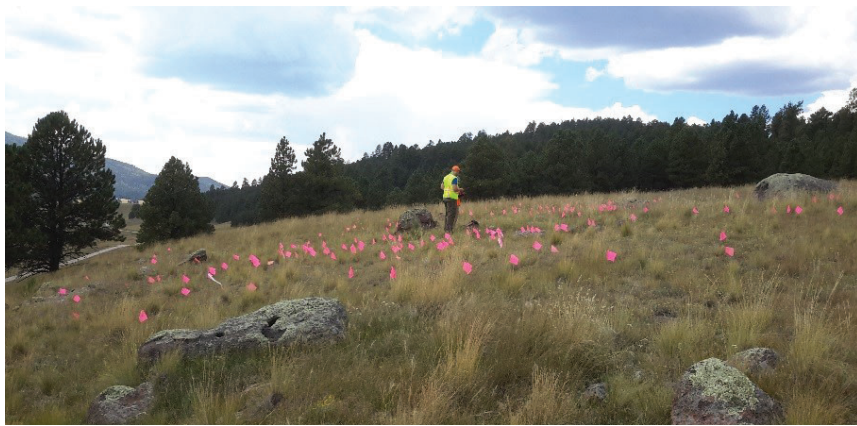
An OCA archaeologist flags artifacts at an archaeological site at Valles Caldera National Park (photo by Sara Niskanen).

OCA staff produced five (5) major technical reports; published three (3) papers in journals or edited volumes; and presented eight (8) professional papers at the 84th Annual SAA meeting in Albuquerque.