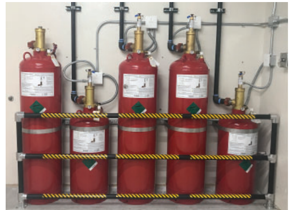
While this photo may belong to the genre of “boring museum photos,” we are pretty excited about our new clean agent fire suppression system, which feeds four ethnology collection rooms (plus a backup tank).

The Laboratory is grateful to the individuals who have committed to donating their remains to the Documented Skeletal Collection this year. Sadly, a number of donors passed away in 2018-19; we hope that their loved ones take comfort in knowing that their generous gift will teach anthropologists for generations to come.