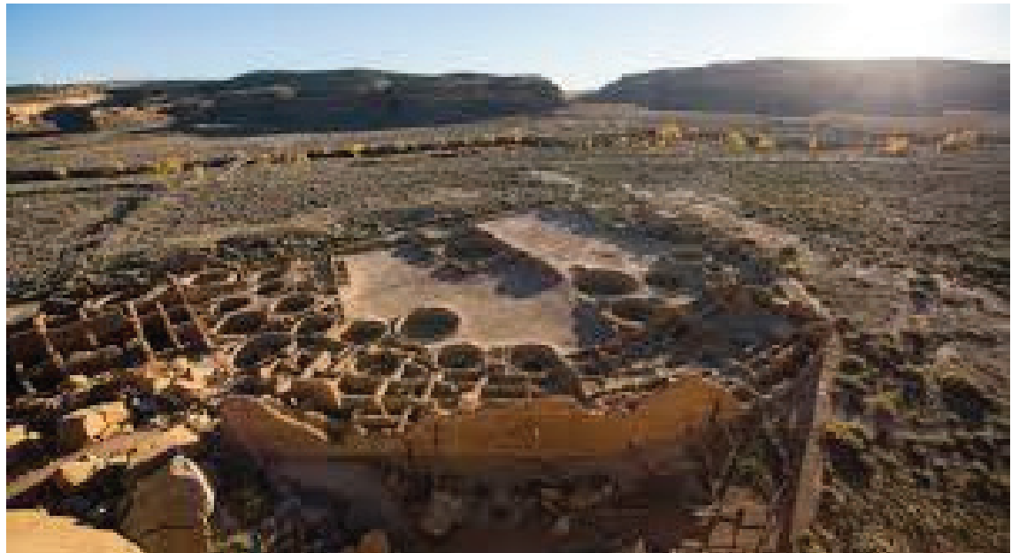
Chaco Culture