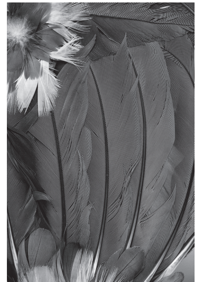
Brazil Blue D

Flames engulfed Brazil's historic National Museum in September 2018. Singular objects and collections representing millions of years of history were reduced to ashes overnight. The fire is especially devastating for Brazil's longest inhabitants, the Indigenous nations of the Amazon. The fire destroyed the last records of indigenous languages no longer spoken and irreplaceable examples of material culture from now colonized indigenous groups. There are hundreds of distinct indigenous groups currently living in traditional ways in the Brazilian Amazon. However, they are under increasing threat from violence and encroaching industrial activity. The exhibition will open early 2020.