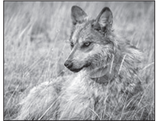
Mexican wolf collared for tracking. Arizona, 2018.

Intertwined: The Mexican Wolf, the People and the Land is on display through July 2019.