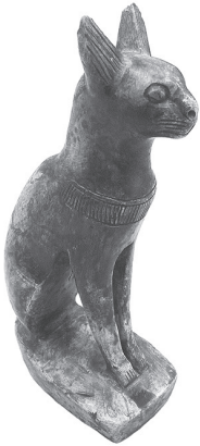
Bestet Cat Egypt Gift of the Nile

Herodotus, the Greek historian and traveler to Egypt in the 5th century BCE said “Egypt is the gift of the Nile.” The river played a vital role in establishing and sustaining Egyptian civilization. The Maxwell Education Department has recently launched a new Ancient Civilization series artifact check-out kit that provides an incredible look at this fascinating world culture! The kit features historical evidence learned from monuments, artifacts, inscriptions, writings, and preserved human remains for educators to present an evidence based exploration of Egyptology.