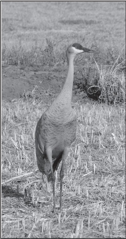
Sandhill Crane at Candelaria Farms Albuquerque.