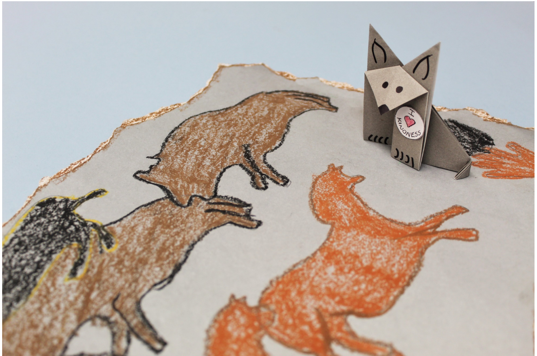
Lulu inspired by cave art