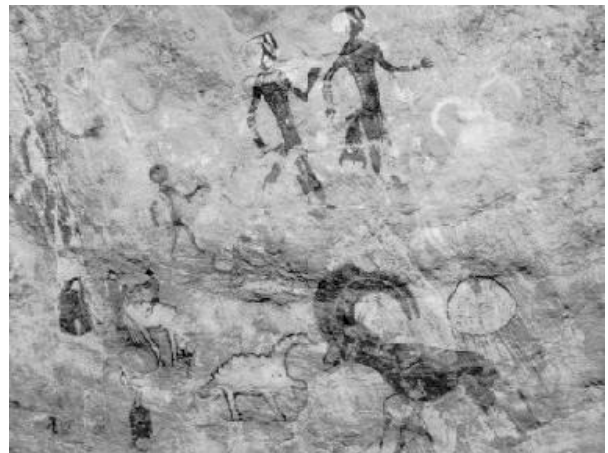
Neolithic cave paintings found in Tassil-n-Ajjer (Plateau of the Chasms) region of the Sahara

Making art is a very human cultural experience, and our expression of art has been a constant practice right from the start.