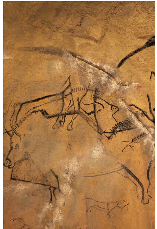
Cave painting reproductions, Maxwell Museum – Salon Noir, Niaux, France