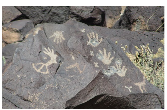
Petroglyphs of human handprints, Piedras Marcadas Canyon, Petroglyph National Monument

Note the vandalism on the petroglyphs above.