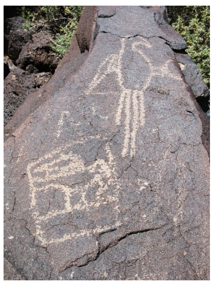
Two macaw parrot petroglyphs, Boca Negra Canyon, Petroglyph National Monument, Albuquerque NM

Scraping away the weathered surface reveals a drawing in a different color.