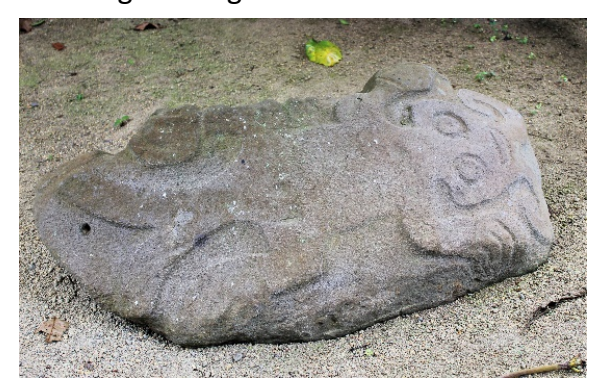
Animal petroglyph, Guayabo National Monument, Costa Rica.

Pecking results in a 3D relief or "raised carving" of a figure.