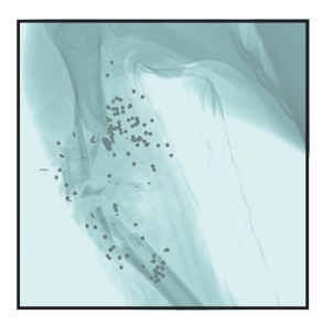
Gun Violence: A Brief Cultural History through Nov. 17