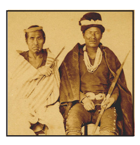
Return to Dinétah: the 150th year anniversary of the Navajo Peace Treaty