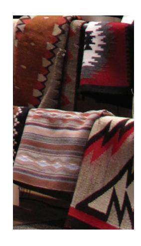
Rug Auction and Appraisal Clinic