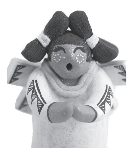
Prudy Corea | Acoma

Purchase gifts for the holidays! Up to 20% discounts throughout the store.