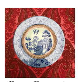
Cross Currents: China Exports and the World Responds