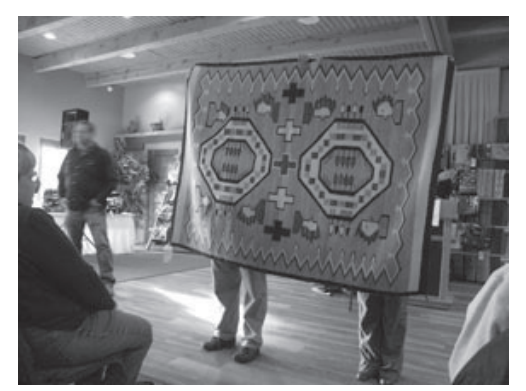
Volunteers display an historic Navajo

More than two hundred traditional and contemporary handmade rugs by weavers of New Mexico and Arizona will be on display and available for purchase. The only local Navajo rug auction, it will feature a wide range of styles in both historic and contemporary rugs.