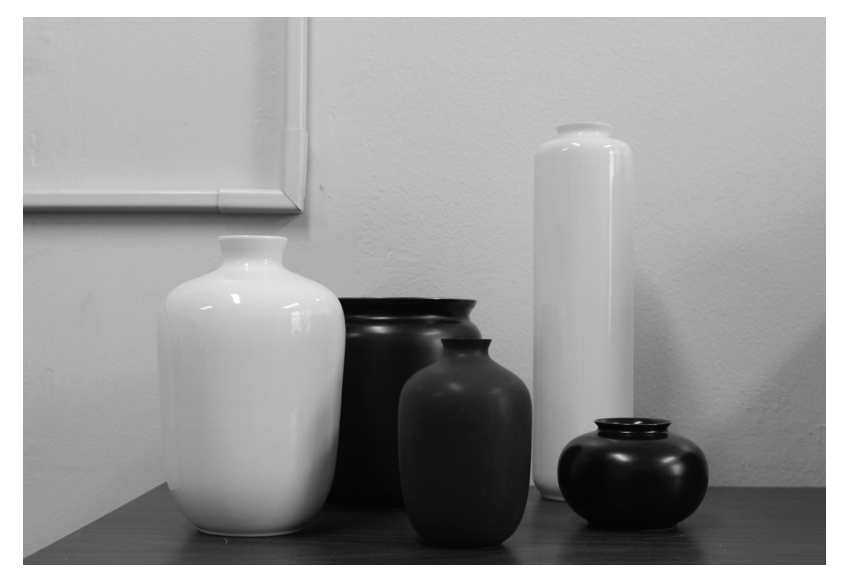
These museum quality ceramics are made by Chinese artisans in a kiln at Jingdezhen. $17 to $70

Our mission is to bring you pieces by local artisans, alongside ethically sourced goods from arround the world reflecting the Maxwell's worldwide collections.