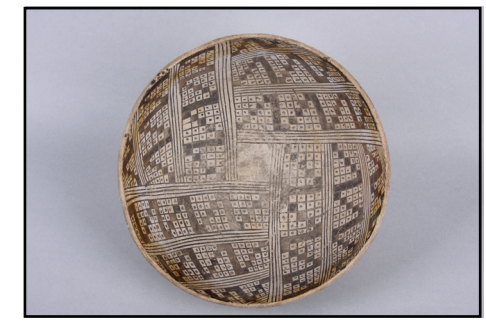
Puerco black-on-white ceramic bowl, Cibola (Chaco) MM 37.32.37

The Maxwell Museum has been awarded a $40,000 grant under the National Endowment for the Arts-National Park Service (NPS/NEA) collaborative initiative "Imagine Your Parks" to support Native artists' residencies and access the renowned Chaco archeological collections housed at the NPS Chaco Museum repository on the UNM campus and in the Maxwell Museum.