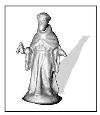
3D Replica of Saint Francis holding birds 3"x 4"

This summer, in addition to all the other fun, hands-on activities, Maxwell Museum summer campers digitally scaned and printed in 3D, objects in the education collection. Digital imaging offers a new way of exploring museum objects and 3D printing adds a whole new dimension. The pieces can be explored in a number of platforms, and printing scale models of special objects serves as keepsakes for campers. The digital files can be shared with schools, libraries and other institutions of learning to explore our collection, and for those organizations with 3D printers of their own, print replicas, providing opportunities for those that don't otherwise have access to the Maxwell Museum exhibits and collections.