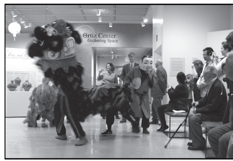
A traditional Lion Dance performed at the opening of Earth, Fire, and Life.

Early China included dozens of cultures spread over many centuries. Imperial rule absorbed disparate groups and was itself replaced by a republic. Over time, the rough-hewn and hand-built evolved to the elegant, reflecting changes in Chinese culture and political life. Earth, Fire and Life: