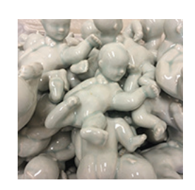
Earth, Fire, and Life Six Thousand Years of Chinese Ceramics