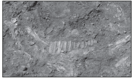
The jaw, including teeth, of a bison as it looked during excavation in Water Canyon

Last summer Dello-Russo conducted a field school for undergraduate archaeology students at the site. The students learned how to document and catalog what they excavated, and heard from visiting experts about a