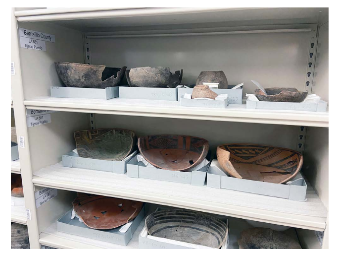
Reorganized pottery from Tijeras Pueblo, Bernalillo County, NM

Changes are underway in the archaeological collections at the Maxwell Museum. If you have come on a collections tour in the basement of the Hibben Center for Archaeology, you likely enjoyed visiting the large storage room that houses the 3,500+ complete pots from across New Mexico and other areas of the Southwest. On your trip through the archaeological pottery collection, you would have seen the pots organized by archaeological pottery type. In 2021, we began the process of changing this structure and reorganizing the pots by geographic area and site, ensuring that vessels from one site are once again living together. For sites in New Mexico, the geographic organization is first by county and then by archaeological site within each county.