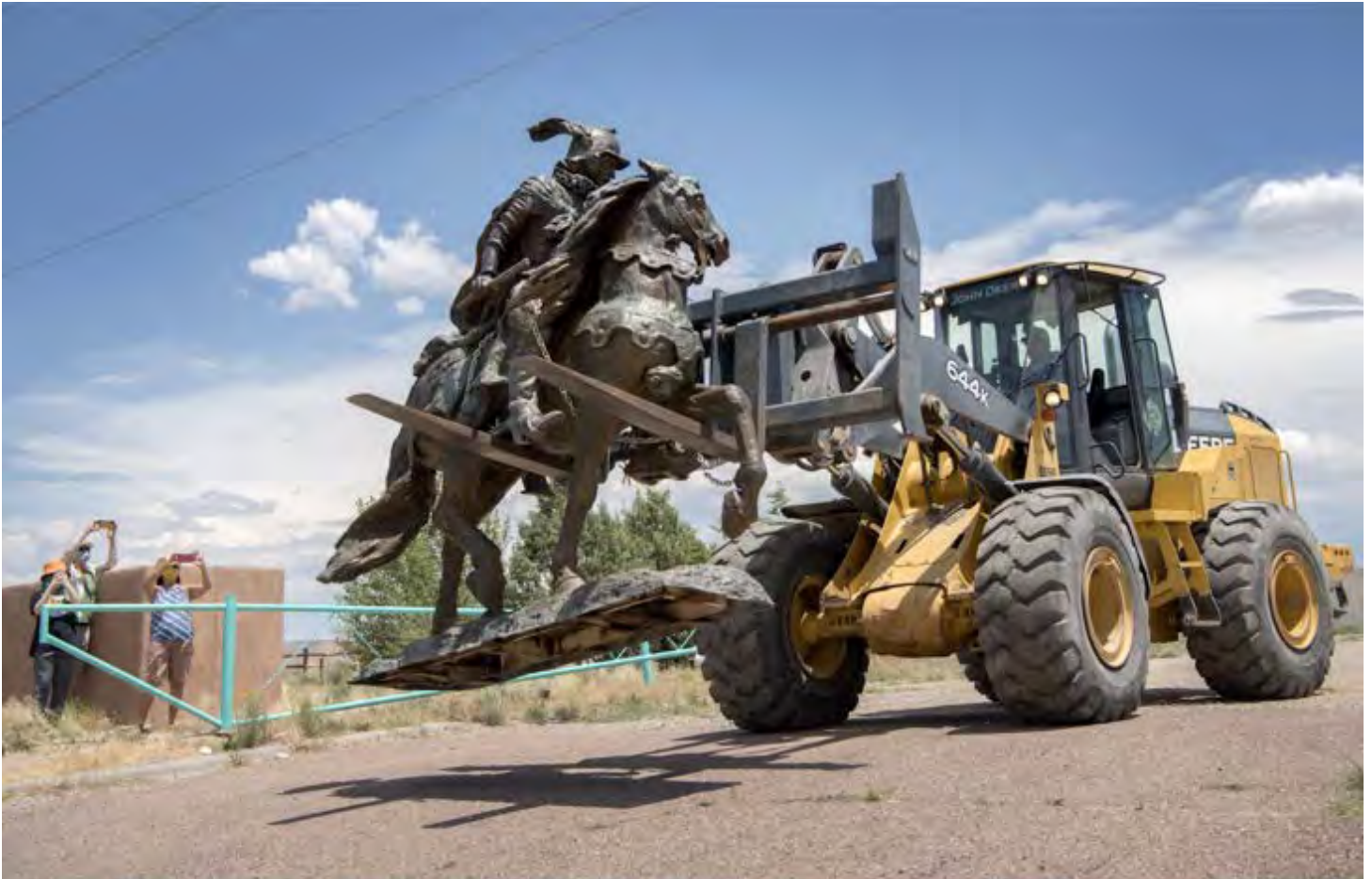
Sculpture of Juan de Oñate being removed 'temporarily', Alcalde, NM, June 15, 2020.

In recent turns of events, as pictured here, on June 15th, 2020, Rio Arriba County removed the sculpture of Don Juan de Oñate, not in response to protests, but rather to protect it from protestors, who were scheduled to protest its removal later that day – the protest did go forward, the fate of the sculpture remains a question.