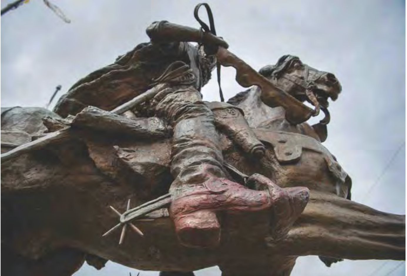
A red tinge remains from vandalism to the boot of the Don Juan de Oñate equestrian statue in Acalde, NM, September 2017.

The individuals who anonymously removed the foot from the statue sent photographs of it and the following statement to local newspapers: