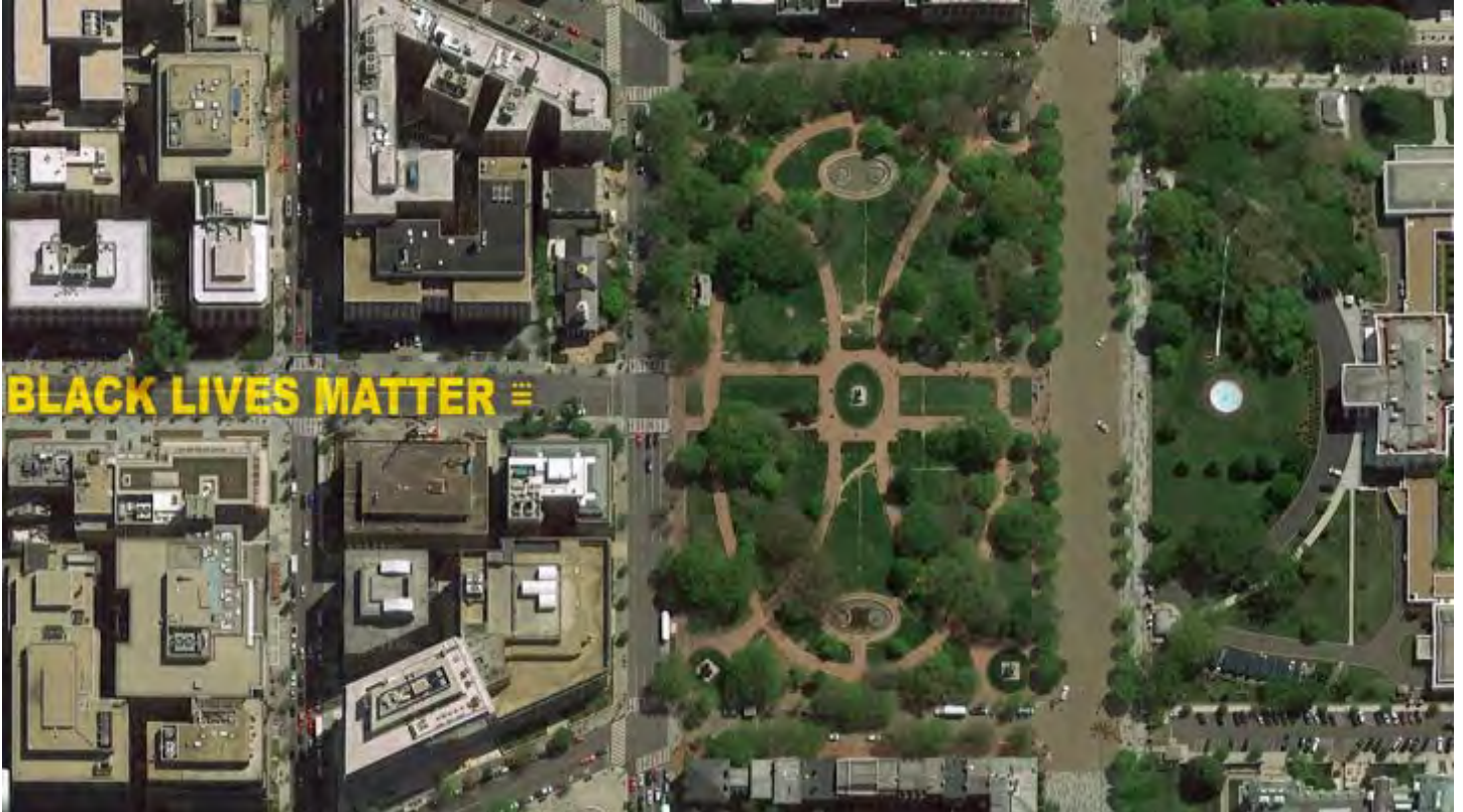
An aerial view of "BLACK LIVES MATTER" painted in roughly 50-foot-wide yellow letters on a section of 16th Street that sits just in front of Lafayette Park, Washington, D.C., June 5, 2020.

In this final image, we circle back to where we began, with the protests over the killing of George Floyd. Muriel Bowser, the Mayor of Washington D.C., renamed a street near the White House "Black Lives Matter Plaza", and had muralists paint "BLACK LIVES MATTER" in roughly 50-foot-wide yellow letters on a section of 16th Street that sits just in front of Lafayette Park, June 5, 2020, altering the area conceptually and literally, which some have considered a defacement and others have celebrated. Lafayette Park, sits directly across from the White House, named for a French hero of the American Revolution, the Marquis de La Fayette. The park, sometimes referred to as "the people's park" was created by Thomas Jefferson, and is iconic both for its location, and for the celebrations and protests it has hosted over the centuries.