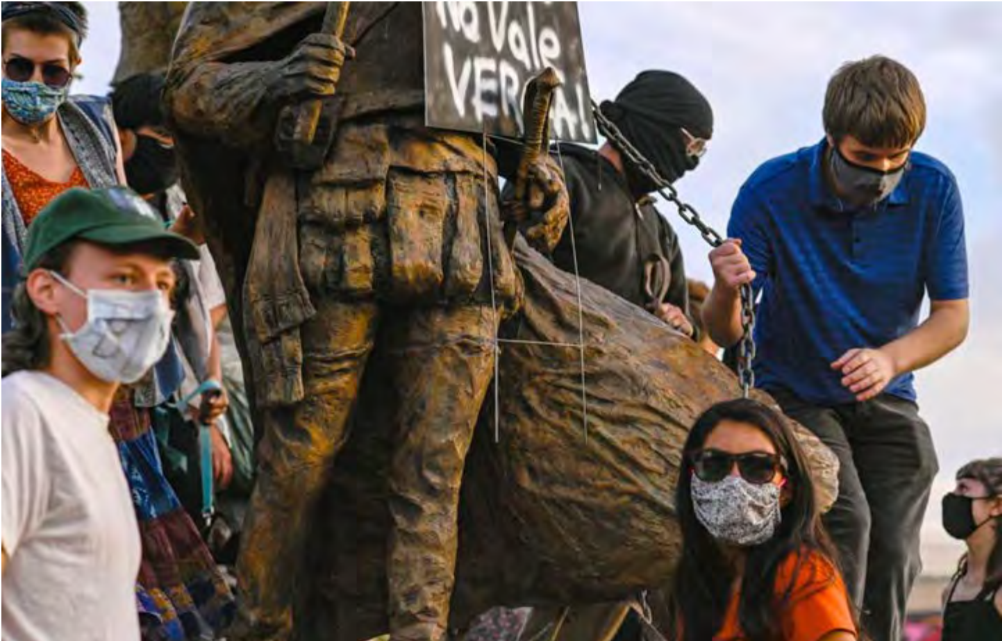
Protesters attach a chain to the statue of Juan de Oñate in Albuquerque, NM, June 15, 2020.

On the same day, June 15 th , 2020, a University of New Mexico Student was shot and seriously wounded in Albuquerque, when he was peacefully protesting in support of the removal of the monument called “La Jornada”, which features several sculpted images including Juan de Oñate leading oxen drawn carts and families involved in the Spanish colonization of the southwest in 1598. The monument, pictured here being prepared to be pulled down by protesters, was located on the property of the Albuquerque Museum, in Tiguex Park. Albuquerque Mayor Tim Keller had the monument removed, stating “the City will be removing the statue until civic institutions can determine next steps.” Police took into custody several members of a right-wing militia group “The New Mexico Civil Guard” and a one-time Albuquerque City Council candidate was charged related to the shooting.