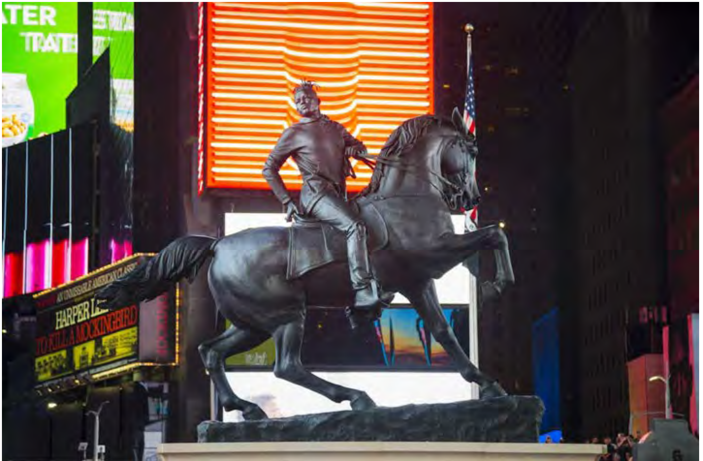
"Rumors of War", by Kehinde Wiley, on temporary display in Times Square, New York City, NY, September 2019.

Contemporary artists have been issuing responses to the more recent vocal outcry about troublesome monuments too. One such response comes from American artist Kehinde Wiley, in which he acknowledges the troubled past while introducing a new icon, in his equestrian statue "Rumors of War", seen here on temporary display in Times Square, New York City, in September of 2019. The sculpture depicts an African American man in dreadlocks, a hoodie, ripped jeans and Nike high-tops, but takes the form of the heroic equestrian statues of Confederate generals of Monument Avenue in Richmond, Virginia.