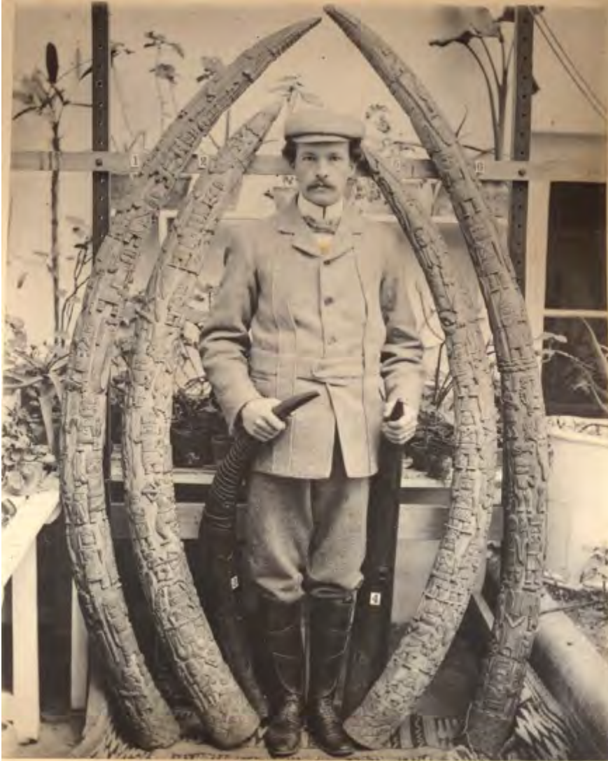
William Downing Webster, posing with carved ivory tusks taken from the city of Benin, 1890.

So, for example, in addition to being ritual objects, works of art, and historical documents, Benin bronze plaques and carved ivories also serve to document historical interactions between the Benin Empire and Europe. Those stories, however, may be fragmented, owing to the manner in which the plaques and ivories were removed from their original context. Here you see these objects pictured with William Downing Webster, one of the most famous dealers of ethnographic objects of the late 19 th and early 20 th centuries.