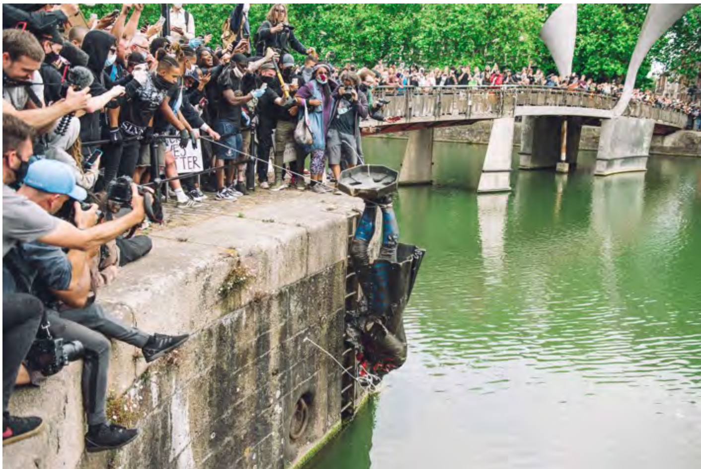
A statue of Edward Colston, a late 17th century slave trader, being pushed into the river Avon, Bristol, UK, June 7, 2020.

(Audio of cheering crowd) That was the sound of a cheering crowd of protestors in Bristol, in the United Kingdom, as they pulled down the statue of seventeenth century slave trader Edward Colston, on June 7 th , 2020.