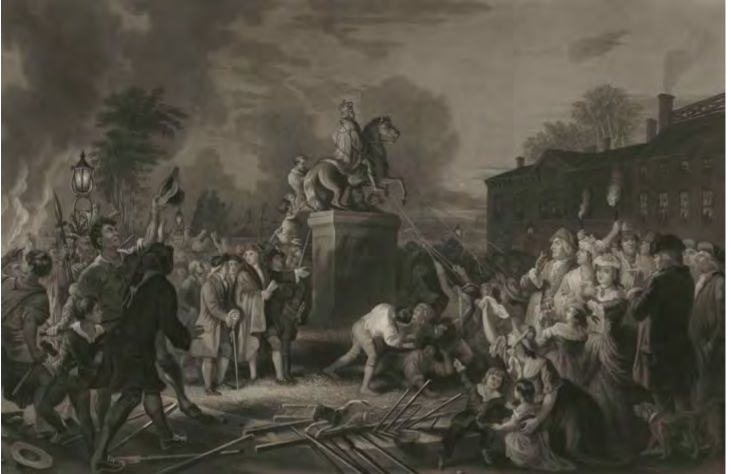
(Detail) "Pulling down the statue of George III by the "Sons of Freedom," at the Bowling Green, City of New York, July 1776". Painted by Johannes A. Oertel, engraved by John C. McRae, ca. 1875.

Over time the term has expanded to include the destruction of symbols of cherished beliefs, people, or institutions such as monuments, memorials, flags and other such material manifestations of cultural capital.