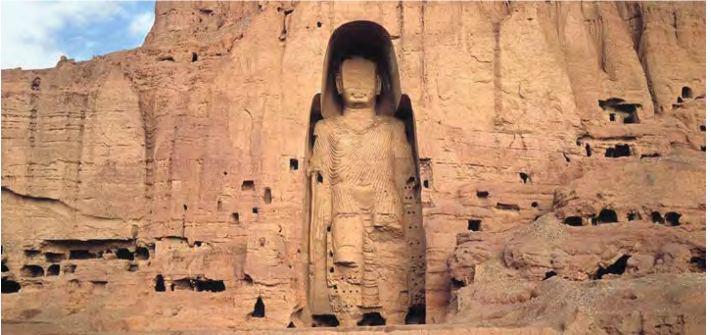
One of the 6 th -7 th century Bamiyan Buddhas of Afghanistan (West niche), before destruction by the Taliban in 2001.

It would seem, as long as humans have created symbols, others have sought to destroy them, creating cycles of veneration and destruction. Religious zealots have destroyed the “idols” required by other forms of worship, or even their own religion’s icons.