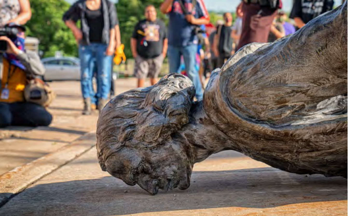
A statue of Christopher Columbus, torn down at the Minnesota State Capitol, Saint Paul, MN, June 10, 2020.

Very recently, with the civil unrest sparked by the George Floyd protests, many memorials in the United States – those of government officials and political or historical figures with contentious histories, Confederate soldiers, and colonizers— have begun to be removed by state and local officials, or defaced, pulled down, or destroyed by protestors. This statue of Columbus at the Minnesota State Capitol was pulled down by protestors on June 10, 2020.