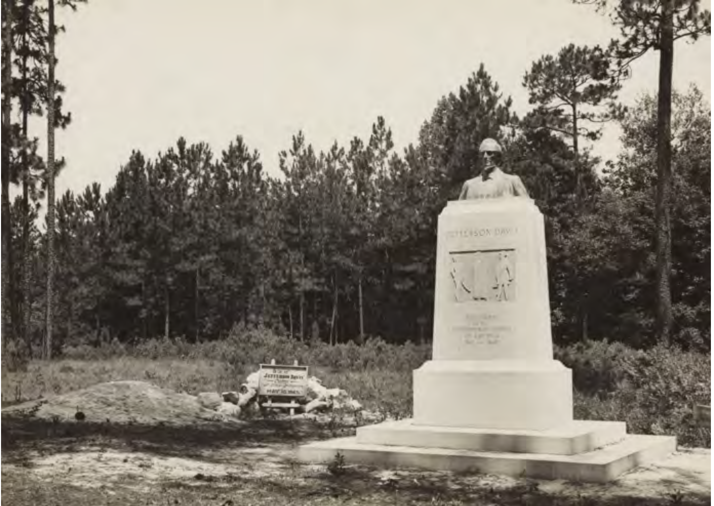
Jefferson Davis Monument, Jefferson Davis Memorial Park, Irwinville, GA, June 3, 1936.