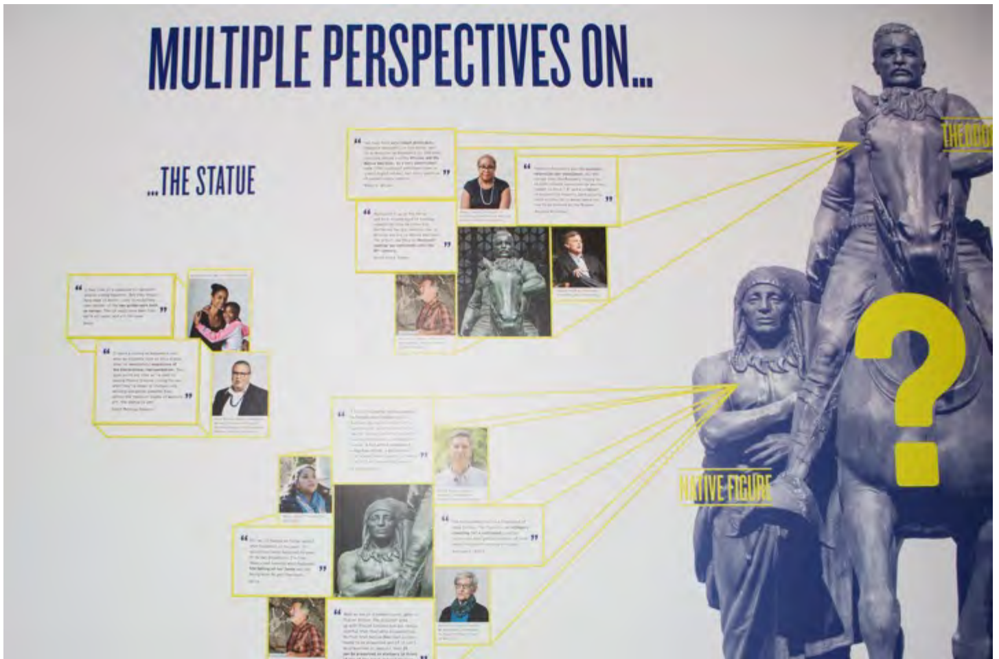
Part of an exhibition at the American Museum of Natural History, "Addressing the Statue," New York City, NY, July 15, 2019.

Although the museum opened an exhibition entitled "Addressing the Statue", a graphic from the exhibition pictured here, that asked the public to weigh in on the controversy over the Roosevelt sculpture, many felt that was not enough, and on June 21, 2020, after many years of controversy, the museum announced the removal of the sculpture that many have argued depicts Black and Indigenous people as subjugated and racially inferior.