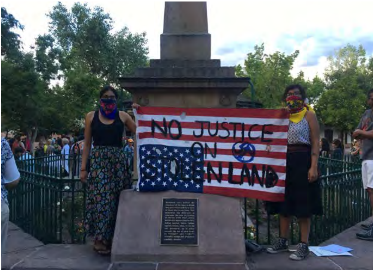
Indigenous activists at the end of an anti-racist rally held on the Santa Fe Plaza, Santa Fe, NM, August 14, 2017.

Other New Mexican acts of iconoclasm have focused on public monuments and traditions, particularly in the state capitol of Santa Fe. One such event, pictured here, occurred on the Santa Fe Plaza, on August 14 th , 2017, led by a group of Indigenous activists participating in an anti-racist rally. As the crowd for the rally thinned, a small group of activists took to the stage while others positioned themselves in front of the monument pictured here.