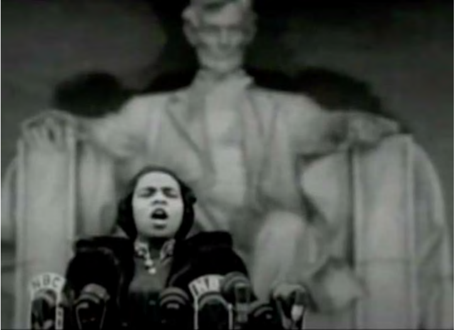
Still from a film recording of Marian Anderson singing in front of the Lincoln Memorial, Washington, D.C., April 9, 1939.

Before considering iconoclasm proper, that is, the destruction of valued or sacred cultural sites and symbols, it is helpful first to consider such sites – such as monuments and memorials themselves - and ask, what purpose do they serve?