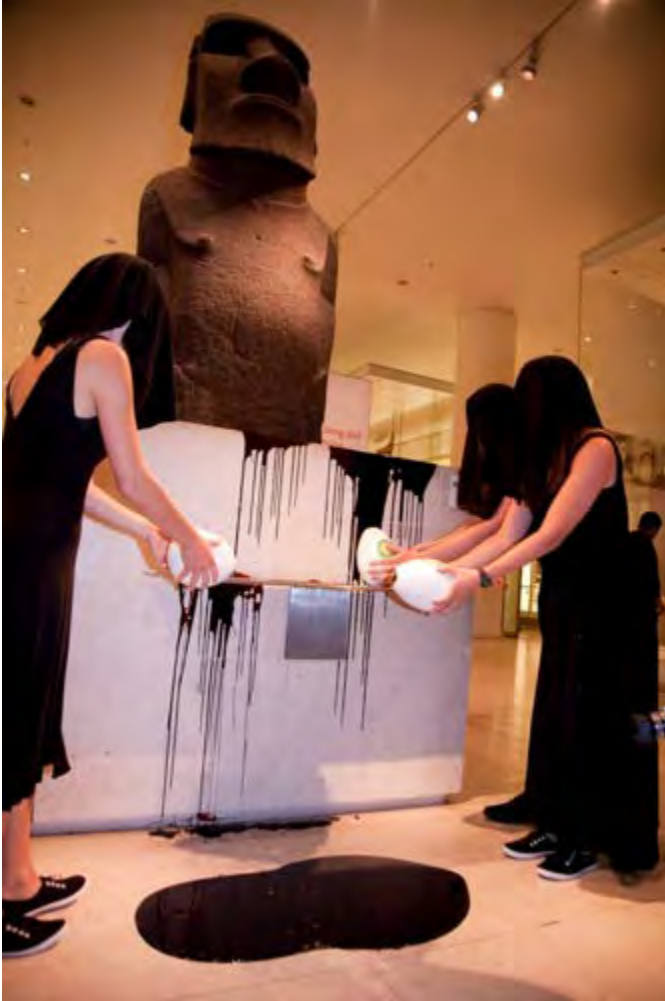
The activist group Culture Beyond Oil protesting in front of the Hoa-Haka-Nana-Ia in the Living and Dying gallery at the British Museum, London, UK, July 2010.

Iconoclasm deeply interests anthropology museums, which preserve objects of cultural or ideological significance. However, removing objects from their original contexts can be part of the destruction of cultures and assertions of political power. Can the collection of objects from other cultures be a form of iconoclasm? It is not just the display of images or objects of veneration that correlate to questions of power, but also the contexts in which they are accumulated and displayed.