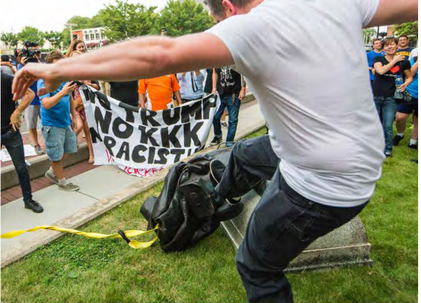
A protester kicks the toppled statue of a Confederate soldier after it was pulled down at the old Durham County Courthouse, Durham, NC, August 14, 2017.

In the United States, many current debates of the last few years about iconoclasm center on the memorials of colonists, particular political figures and Confederate soldiers, whose venerated status is increasingly a matter of sometimes-violent disagreement.