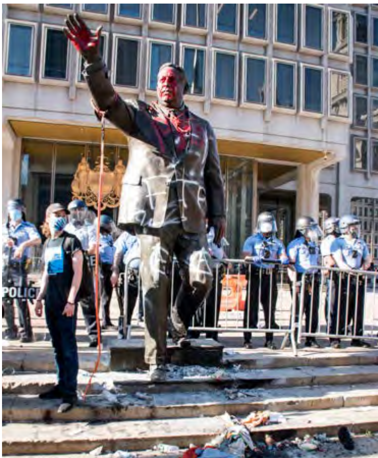
Protest for George Floyd, the widely hated statue of former mayor Frank Rizzo covered in graffiti, Philadelphia, PA, May 30, 2020.

This exhibition was displayed in the Maxwell Museum of Anthropology in 2018 as part of our Current Issues in Anthropology series. We have created this online version in July of 2020 with the ongoing protests in response to the killing of George Floyd in mind. We are in turbulent times and join you in reflecting on them. The Maxwell Museum also joins so many in expressing our anguish and frustrations in these times of unrest and a global pandemic.