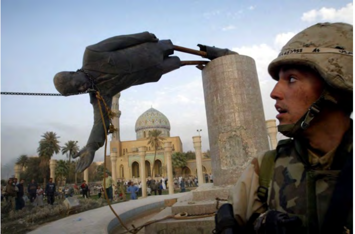
A U.S. soldier watches as a statue of the former leader of Iraq, Saddam Hussein, falls in central Baghdad's Firdaus Square, Baghdad, Iraq, April 2003.

In another image A U.S. soldier watches as a statue of the former leader of Iraq, Saddam Hussein, falls in central Baghdad's Firdaus Square, April 2003. The statue was pulled down by American Marines as the war in Iraq was just getting underway.