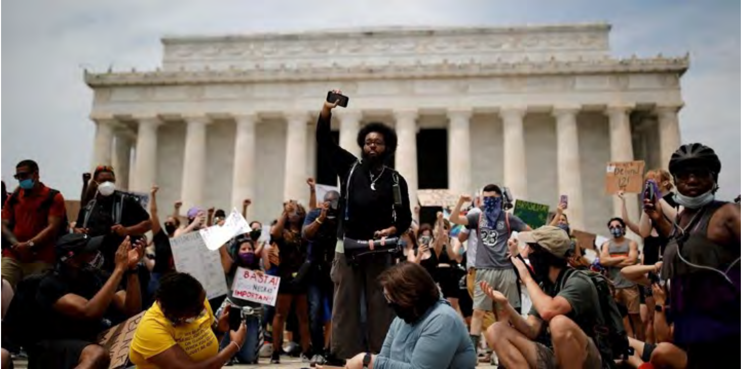
Demonstrators gather at the Lincoln Memorial during a protest against racial inequality in Washington, D.C., June 6, 2020.

Anthropological studies of such sites reflect that the materiality of monuments can elicit a collective mode of remembering, shaping our recall of the past, and creating shared cultural memories that may or may not be related to the specific facts of past events, but regardless, can be powerful places of emotional, communal and contested experience.