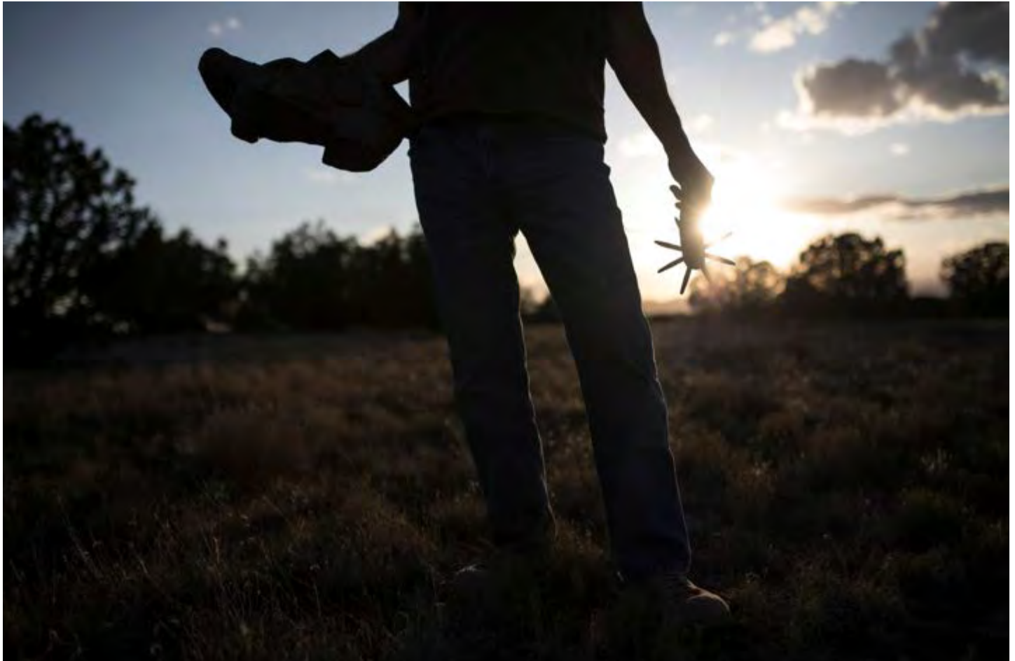
The man who 20 years ago, said he cut off the right foot of the Don Juan de Oñate statue in Alcalde, NM, September 2017.

On September 30, 2017, the front page of the New York Times highlighted the saga of the statue of Spanish colonizer Juan de Oñate erected in 1993 in Alcalde, New Mexico. In January 1998 the statue's right foot was removed. The act recalled the 1598 battle between Oñate's Spanish forces and the village of Acoma. After winning the battle, Oñate severely punished the people of Acoma. Many Acoma men over the age of twenty-five had one foot cut off and then were forced into twenty years of penal servitude.