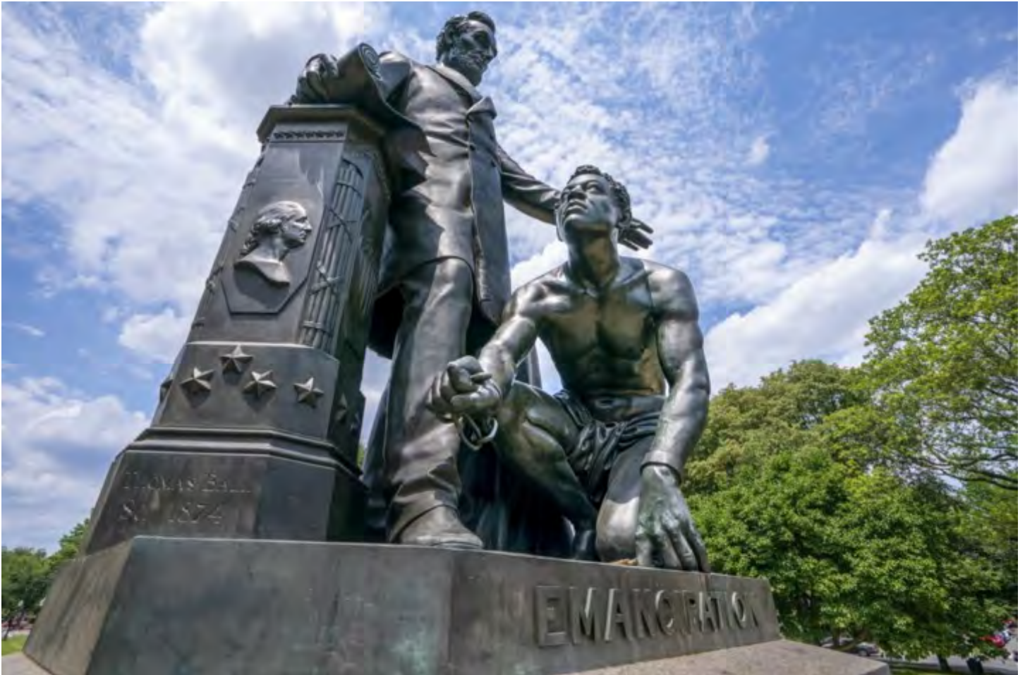
The Emancipation Memorial in Lincoln Park, depicting a freed slave kneeling at the feet of President Abraham Lincoln, Washington, D.C., June 25, 2020.

Seen here is a contemporary photograph of the memorial, which was unveiled in April of 1876. At that time, the abolitionist Frederick Douglass wrote a letter to the newspaper The New Republic , voicing his discontent with the statue, saying “The Negro here, though rising, is still on his knees and nude. What I want to see before I die is a monument representing the Negro, not couchant on his knees like a 4-footed animal, but erect on his feet like a man. There’s room in Lincoln Park for another monument and I throw out this suggestion to the end that it may be taken up and acted upon.”