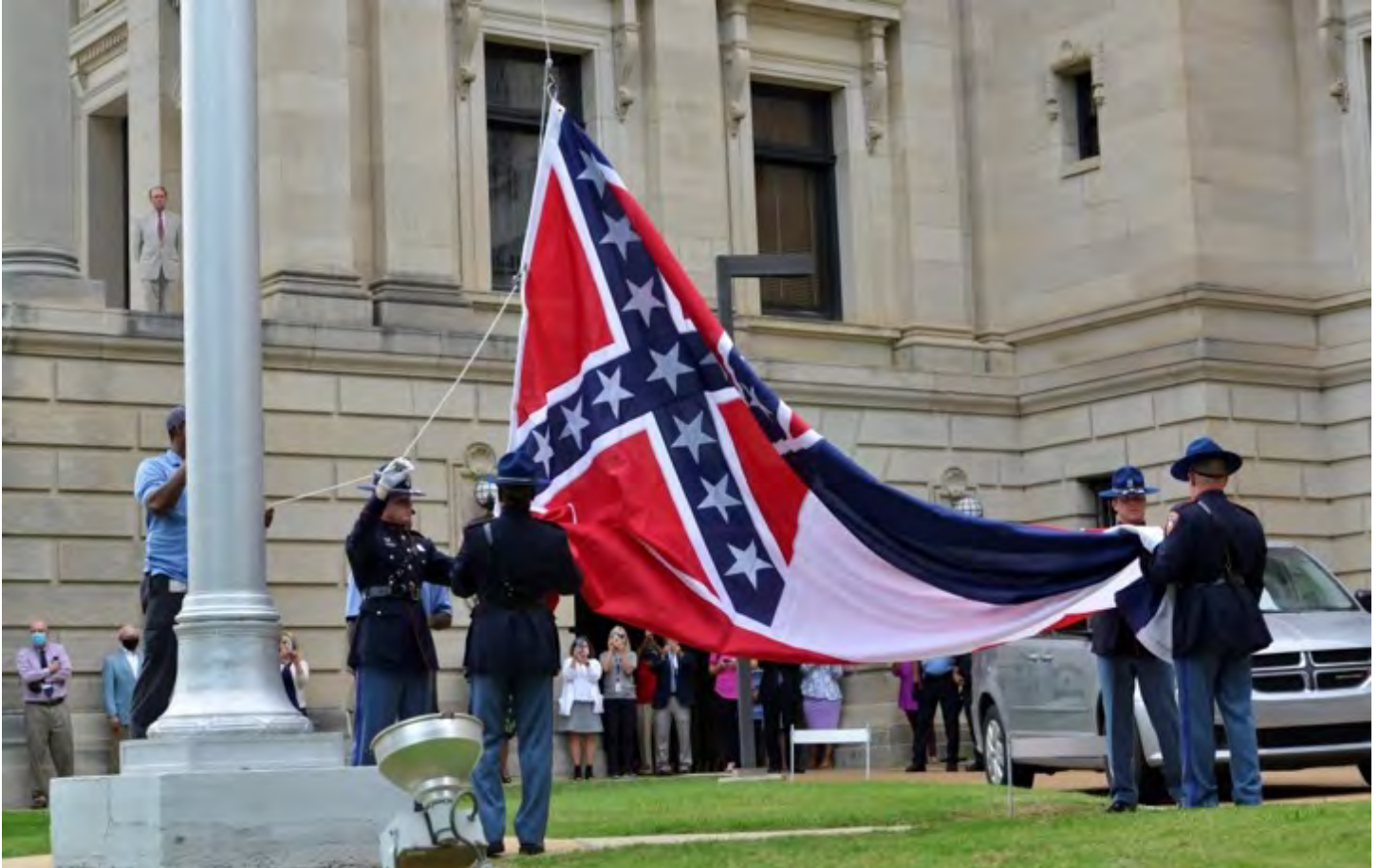
Members of the Mississippi Honor Guard lower the state flag at the State Capitol, a day after a bill was signed into law that would replace the state flag that includes a Confederate emblem, in Jackson, Mississippi, July 1, 2020.

And now, beginning in June of 2020, many organizations, and local and state governments have begun banning the display of the Confederate flag, such as seen here, with the retirement of the Mississippi State flag on July 2 nd , 2020. The retired flag was the last US state banner featuring a Confederate emblem.