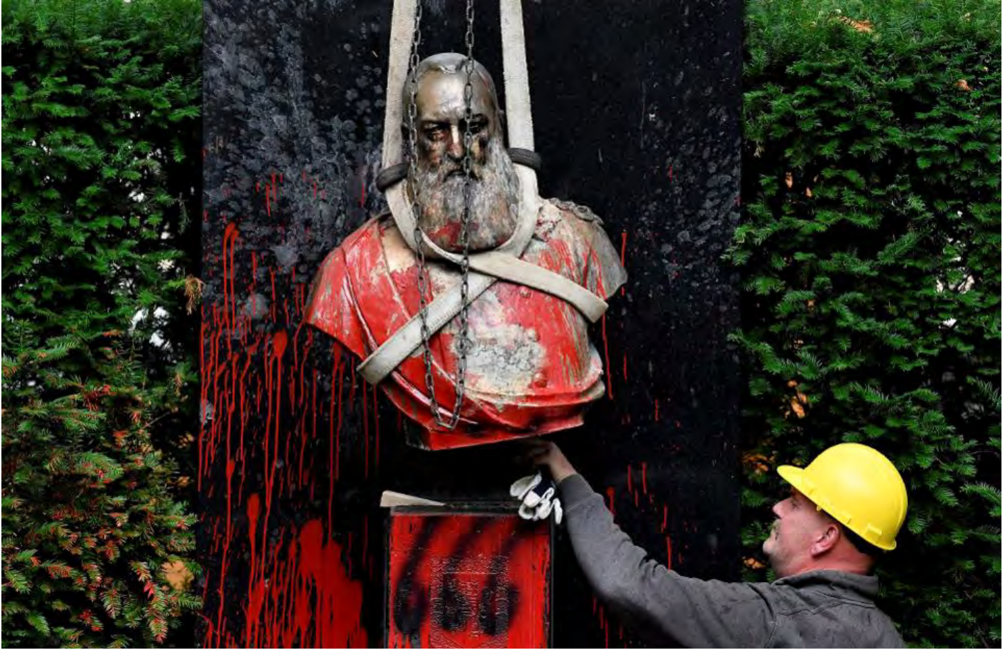
The removal of the vandalized statue of King Leopold II of Belgium, Ghent, Belgium, June 30, 2020.

In this image, the bust of King Leopold II of Belgium was removed from a park in Ghent on June 30, 2020. That date was the 60 th anniversary of the Democratic Republic of Congo's independence from Belgium.