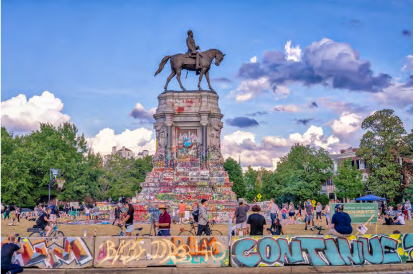
The defaced statue of Confederate General Robert E. Lee on Monument Avenue, Richmond, VA, June 23, 2020.

As long as humans have created symbols, others have sought to destroy them, creating cycles of veneration and destruction. Iconoclasm, the destruction of sacred images or representations, is so relevant to the work we do in anthropology museums, where a large part of what we do is preserve objects of cultural or ideological significance. This exhibition investigates current debates about iconoclasm.