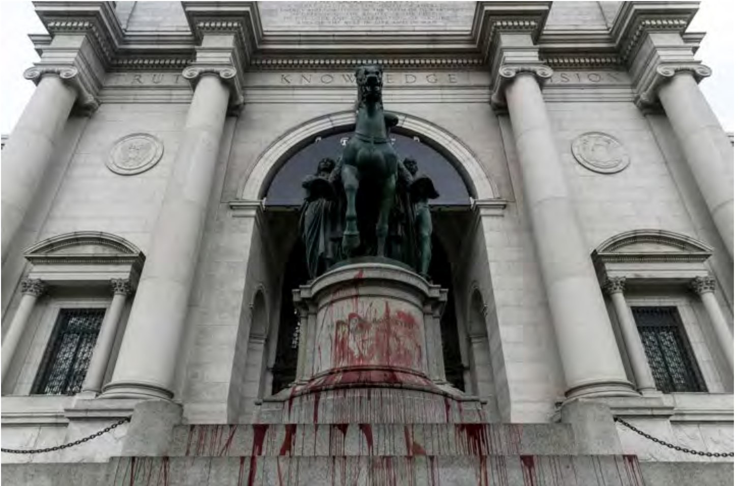
The vandalized Theodore Roosevelt statue outside the American Museum of Natural History, New York City, NY, October 26, 2017.

As already mentioned, museums are not spared such responses, in relation to the collections they hold, the funding they receive, and the memorials that are often part of their architecture and settings. On October 26 th , 2017, an organization calling themselves “The Monument Removal Brigade” splashed a red paint on a statue of Theodore Roosevelt, in front of the American Museum of Natural History in New York.