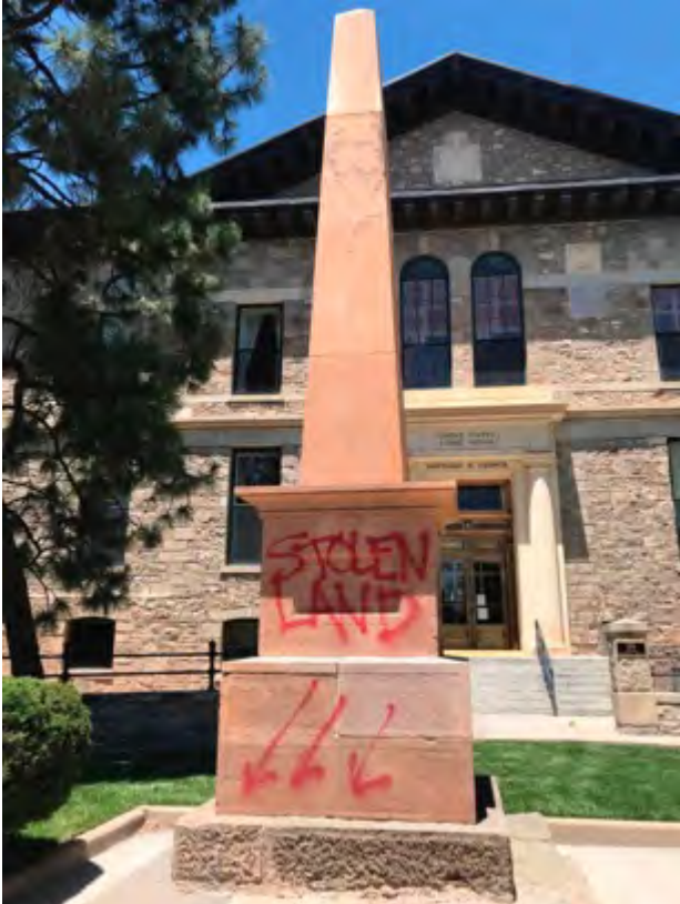
A vandalized obelisk in front of the U.S. Courthouse in Santa Fe honoring frontiersman Kit Carson, Santa Fe, NM, June 17, 2020.

On June 18 th the Mayor of Santa Fe, Alan Webber, signed a proclamation announcing the removal of three controversial monuments related to New Mexico's history of colonization by first, the Spanish, and later the United States. These include: a statue of Don Diego de Vargas, an obelisk commemorating the life of Kit Carson; and another obelisk honoring U.S. Union soldiers of the Civil War. This proclamation in turn sparked counter protests, though the proclamation currently stands.