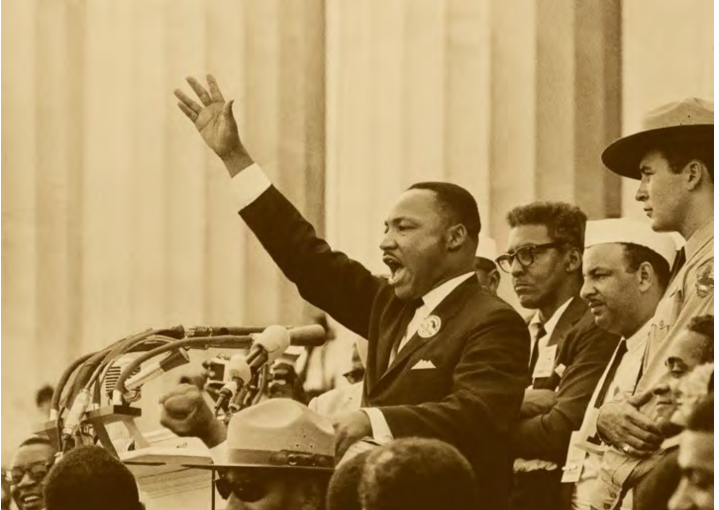
Rev. Dr. Martin Luther King Jr. delivers his 'I Have a Dream' speech at the March on Washington, Lincoln Memorial, Washington, D.C., August 28, 1963.

In broad terms, monuments, memorials and similar material expressions of state or community identity are sites where collective memory is created and marked.