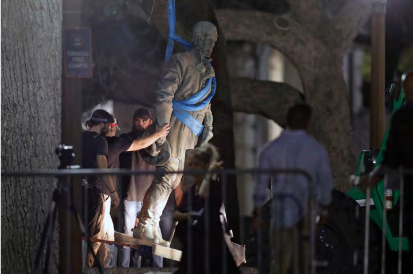
Statue of Robert E. Lee being removed from University of Texas, Austin, TX, August 21, 2017.

In another example from 2017, on August 21 st of that year, at the University of Texas, Austin, statues of two Confederate generals, Robert E. Lee, pictured here, and Albert Sidney Johnston, and the Confederate cabinet member John Reagan, were removed. This was following the removal of a statue of Jefferson Davis in 2015.