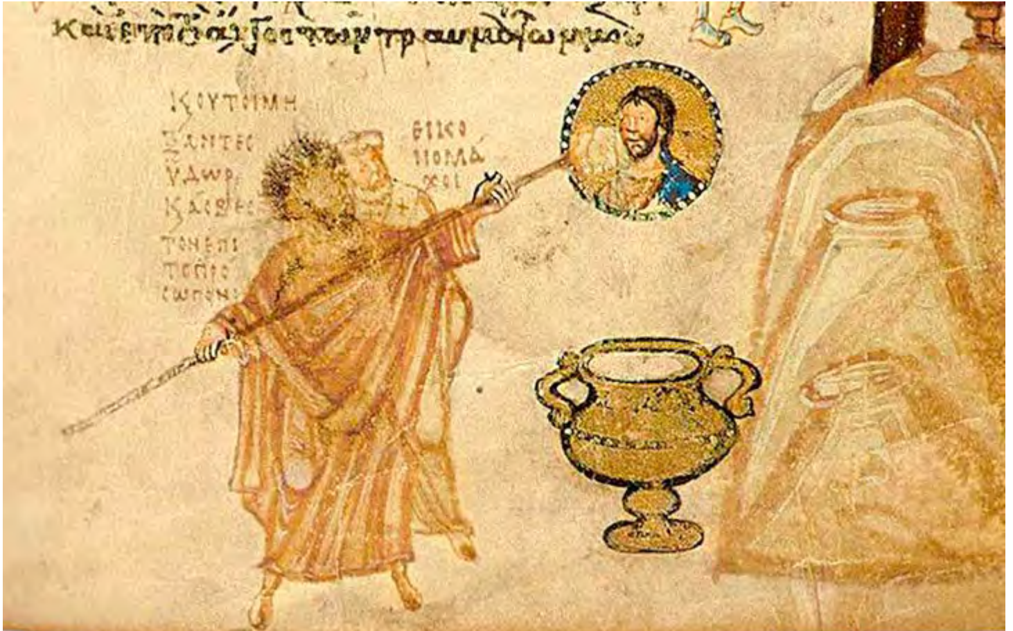
(Detail) Khloodov Psalter, 9th century. The image represents the Iconoclast theologian, John the Grammarian, and an iconoclast bishop destroying an image of Christ.

Iconoclasm is the destruction of sacred images or representations. Originally iconoclasm referred to the destruction of actual icons , as major religious leaders and their followers sought to ban the veneration of sacred images (images representing Christian saints, the Virgin Mary and Christ) during Byzantine and Protestant Reformation eras.