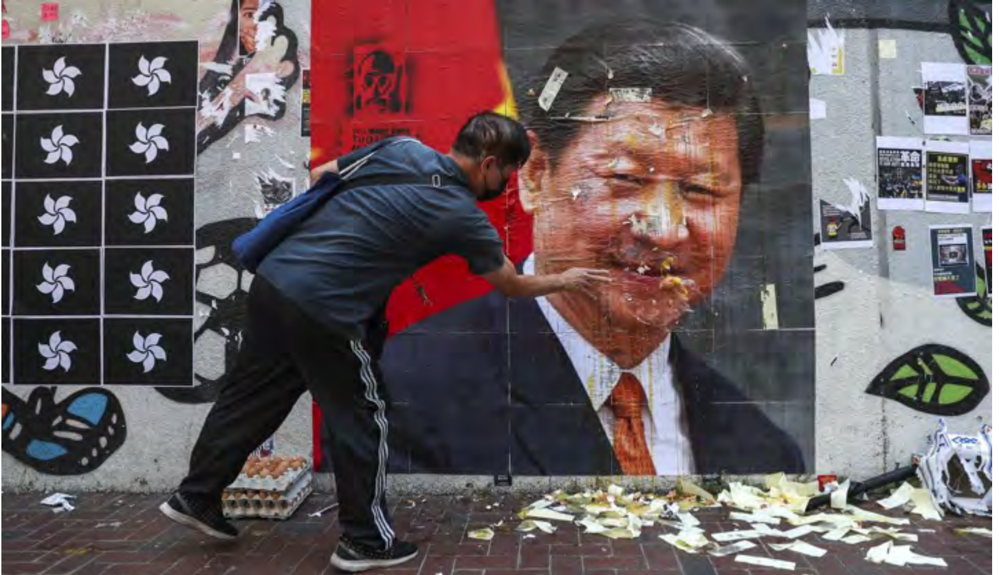
A defaced image of Chinese President Xi Jinping is seen in Hong Kong, October 2019.

In this image, a complicated history of colonization manifests in acts of protest and iconoclasm in Hong Kong, when a man contributes to the defacement of an image of Chinese President Xi Jinping in October of 2019.