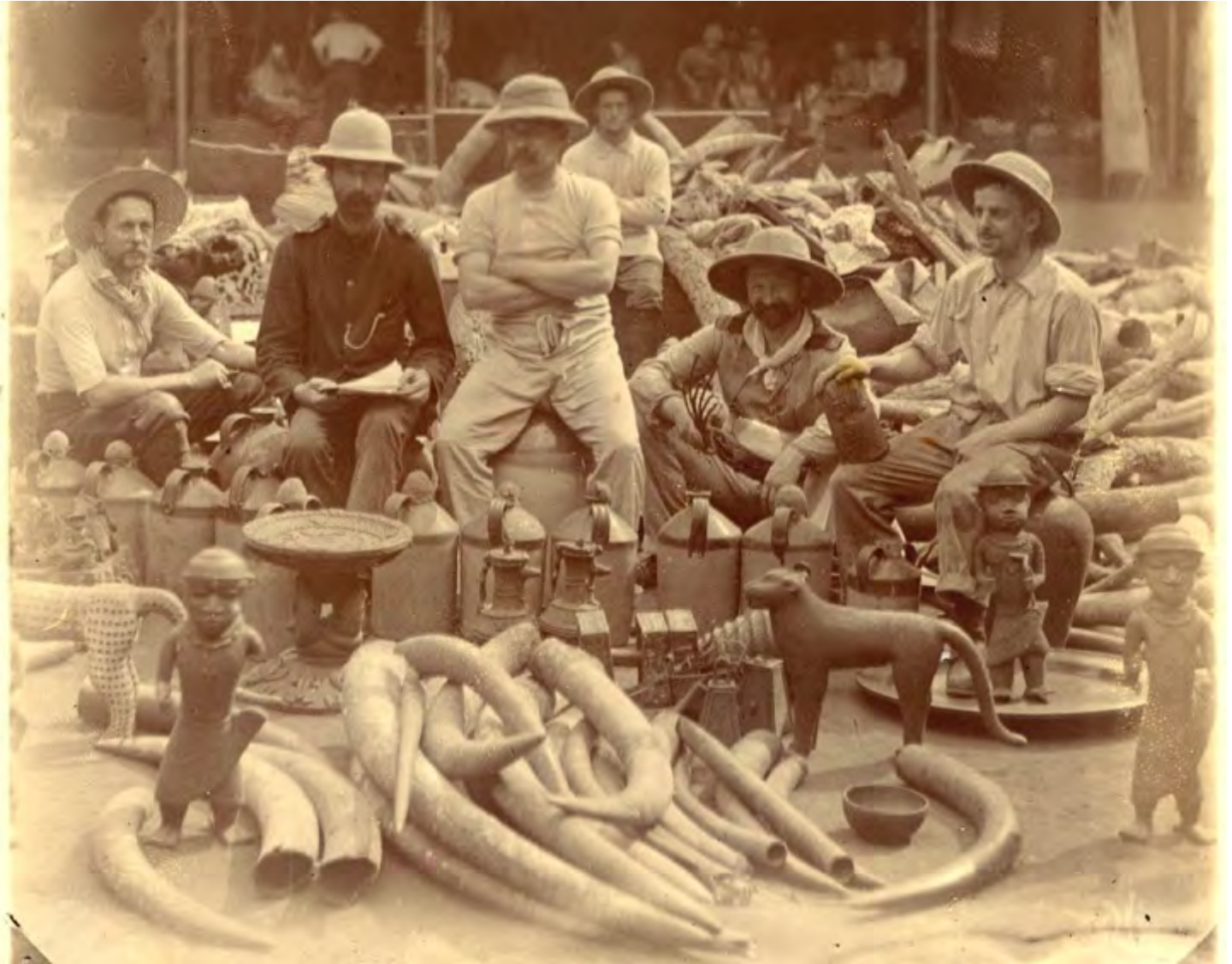
(Detail) British soldiers posing with works of art of the City of Benin, Sir Harry Holdsworth Rawson, Benin City, Edo State, Nigeria, 1897.

It was Britain's so-called Punitive Expedition of 1897, which destroyed the Kingdom's capital, Benin City. The accompanying looting, which could also be considered an act of iconoclasm, scattered many of these plaques and ivories into new networks of circulation. Pictured here, British soldiers surrounded by looted works of art, from that time.