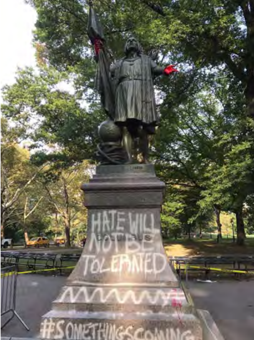
A vandalized statue of Christopher Columbus in Central Park, New York City, NY, October 3, 2017.

More recently, protests against Columbus Day have been accompanied by acts of iconoclasm aimed at representations of Christopher Columbus. Many opponents of Columbus Day believe that it should be replaced with Indigenous Peoples Day, to recognize the violence inflicted on the original inhabitants of the Americas by Columbus and later colonizers.