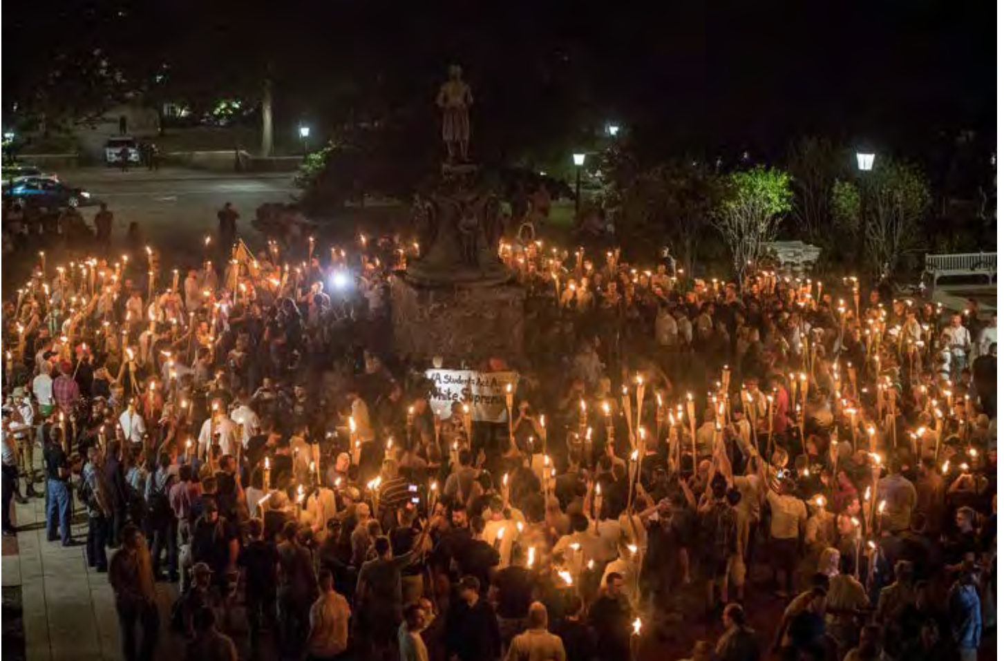
Torch-bearing white nationalists gather around the base of a statue during a demonstration, Charlottesville, VA, August 11, 2017.

In 2017, Charlottesville, Virginia became the epicenter of the national debate on race. On August 11, 2017, white nationalists descended on Charlottesville, and on the University of Virginia campus for a “Unite the Right” rally protesting the plan to remove a statue of Confederate General Robert E. Lee. During the violence that erupted, counter-protester Heather Heyer was killed.