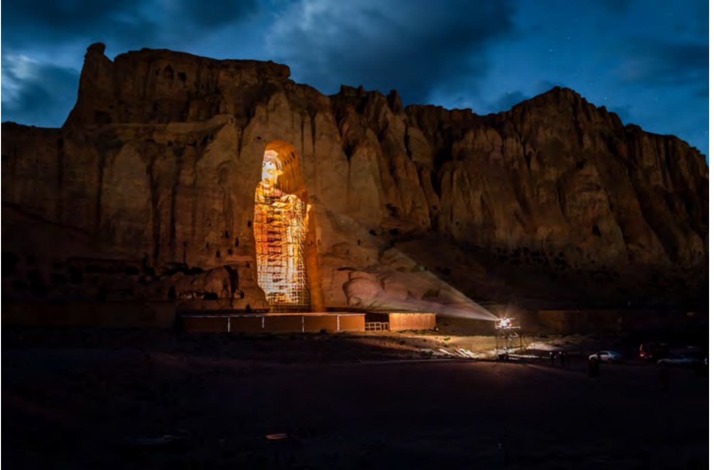
A 3D light projection of how a destroyed Buddha, known as Solsol to locals, might have looked in its prime, Bamiyan, Afghanistan, June 7, 2015.

In June of 2015, two Chinese documentarians, Janson Yu and Liyan Hu, created and projected 3D holograms of the Bamiyan Buddhas into the empty niches where they once stood, as a temporary re-creation and counter action to the destruction of the statues 14 years earlier.