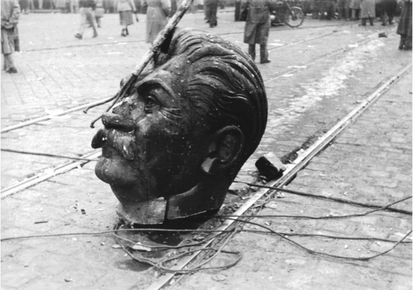
The damaged and decapitated head of a statue of Stalin, on Grand Avenue, Budapest, Hungary, October 23, 1956.

As political regimes defeat rivals, they also remove or transform the symbols that represent the former order. Erecting or destroying monuments doesn't just reflect authority but is a way to promote or change it.