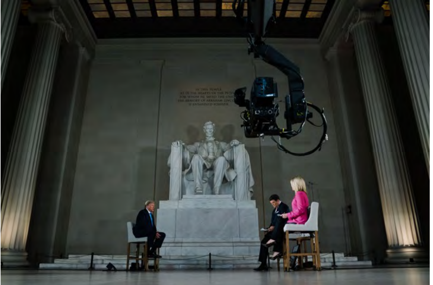
President Donald Trump with Fox News interviewers at the Lincoln Memorial, Washington, D.C., May 3, 2020.

In some instances, such memorializing sites may also be places where we are asked to forget as well as to remember, directing us to select certain versions of history and events, while obscuring others.