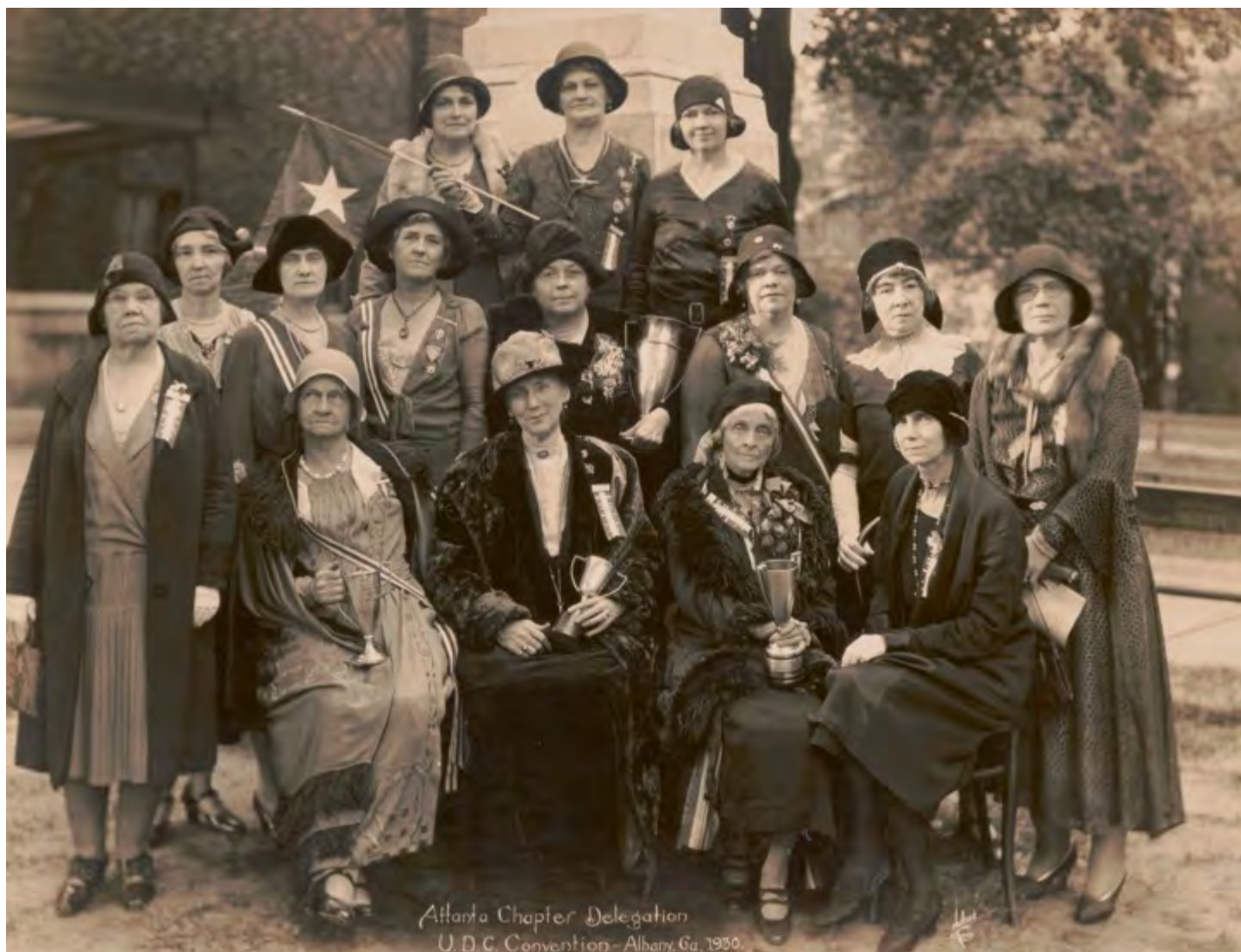
Members of the Atlanta delegation of the United Daughters of the Confederacy, by Holland Studio, Albany, GA, 1930. Photo credit: The Library of Congress.

The confrontation was covered widely on national news and inspired further acts of vandalism and iconoclasm focused on monuments that nominally honor the Confederacy. Opponents of the monuments point to the fact that most were erected to legitimize continued white dominance of Southern society. Indeed, Robert E. Lee himself, the losing general of the Civil War, had denounced the construction of monuments, writing in 1869, in response to a proposal to build a monument at Gettysburg, he said: