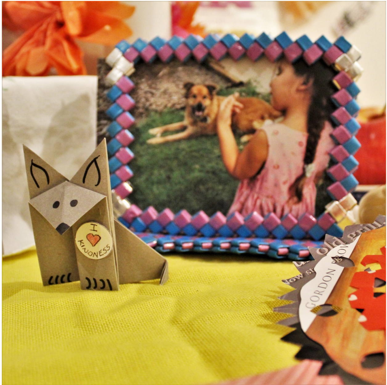
Even the dog can have a place at the table!