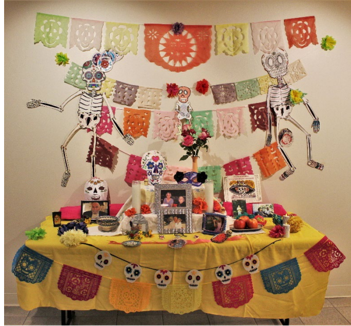
Maxwell Museum ofrenda

An ofrenda is an altar with multiple tier levels and it is meant to honor our loved ones who have passed away. It also serves as a welcome to them as they cross over into our world during Día de los Muertos.