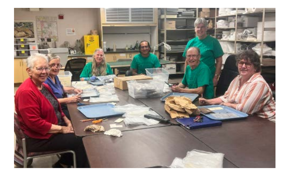
Archaeology Collection Crew, October 9, 2024

Since 2003, the Wednesday morning archaeology collection volunteers have been gathering in the Hibben Center basement helping to organize our backlog of uncatalogued collections. Volunteers make important contributions to the Maxwell, in collections, as docents, editors, assisting in our events, and in many other ways. If you are interested in volunteering visit our <a href="mailto:website">website</a> or email <a href="mailto:maxwell@unm.edu">maxwell@unm.edu</a>.