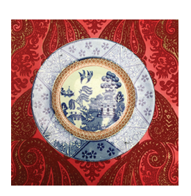
Cross Currents China Exports and the World Responds