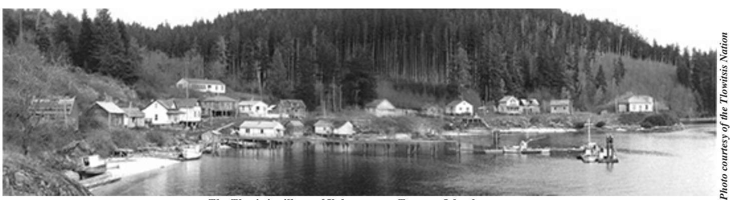
The Tlowitsis village of Kalagwees on Turnour Island.

For more information please visit www.tlowitsisnation.ca or http://maxwellmuseum.unm.edu